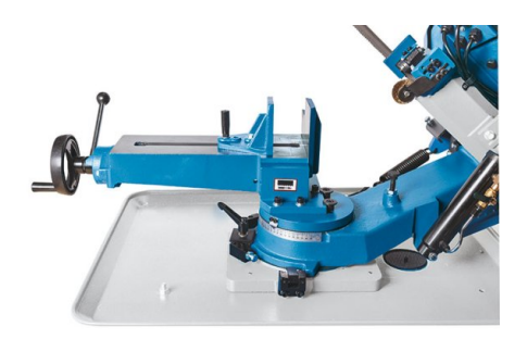
Reduced down-time: precisely adjustable angular stops and quick-action clamping at the vise