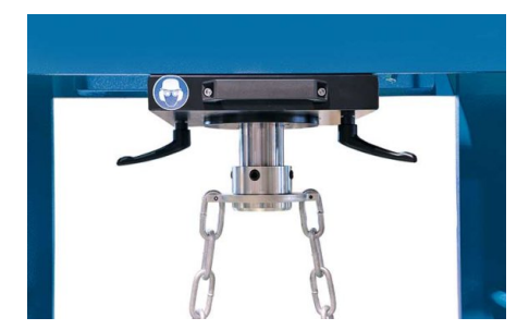
Table height can be adjusted easily via hydraulic lifting gear