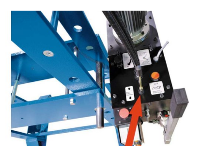
The press is operated via joystick