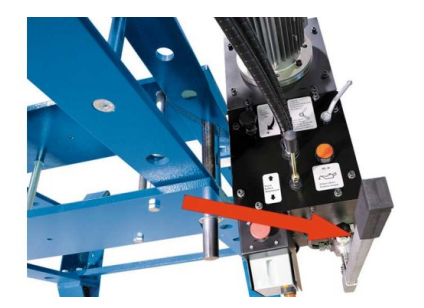
A hand pump is available for very delicate work