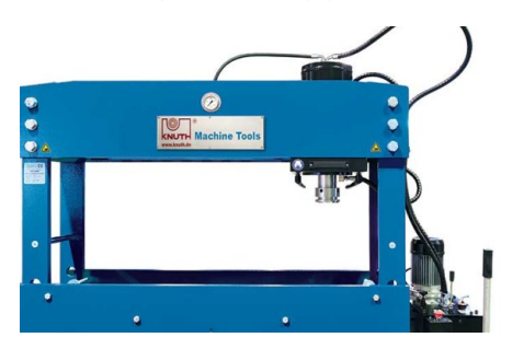
The hydraulic cylinder can be moved laterally and is clamped mechanically