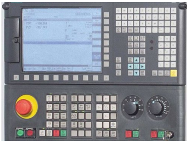
Siemens Sinumerik 828 D - a compact and user-friendly solution for lathes