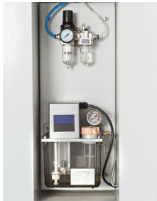
Central lubrication device and maintenance unit