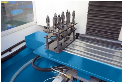
Tool holder with 4 positions