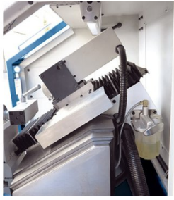
Slant bed machine frame