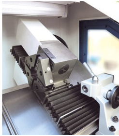
4-fold tool turret and tailstock