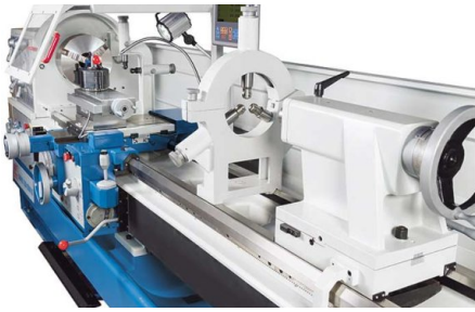
Rests ensure maximum precision when machining long workpieces